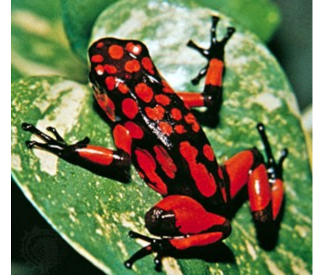
Poison Dart Frog

Poison dart frogs have bright colors to warn predators that they are poisonous. They live in tropical rainforests in South and Central America. Poison dart frogs eat insects and other small arthropods. Any animal gets poisoned from the poison that the frog gives. The only animal that is immune to the poison is the snake called the leimadophis epinephules.