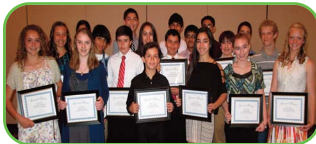
VMS Principal's Honor Roll 2012